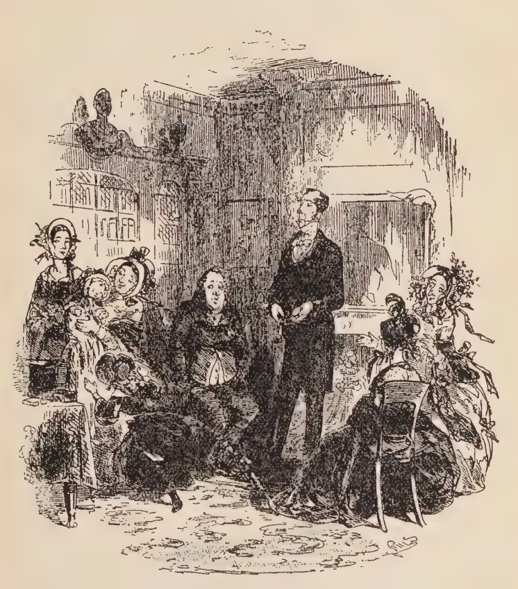
The Christening Party.